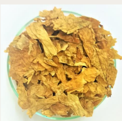
Figure 1. Tobacco commercial blend

Tobacco blend was obtained in dry condition, after industry processing. Samples were kept at ambient temperature at dark and dry place before the extraction. Tobacco blend was pulverized before the extraction (MRC Sample mill C-SM/450-C. Holon, Israel).